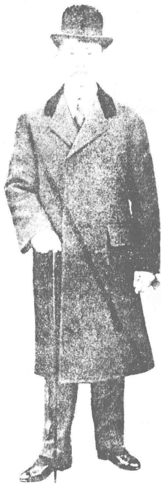
Dr. V. K. Wellington Koo, Chinese Minister to the United States, who made it possible for the author to visit the United States.