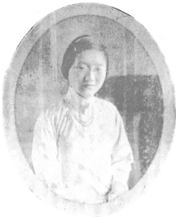
Madame V. K. Wellington Koo