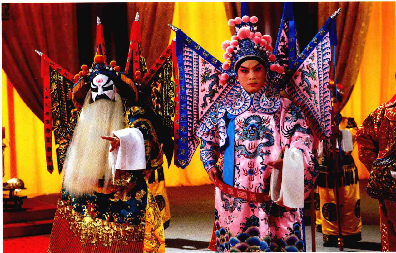
10. 项伯劝项羽权衡轻重，集中力量破汉。项羽陷入沉思，众将亦不敢多言。 Xiang Bo suggests Xiang Yu to balance weight and concentrate on attacking Kingdom Han. Xiang Yu is deep in meditation. All the others don't dare to say anything.