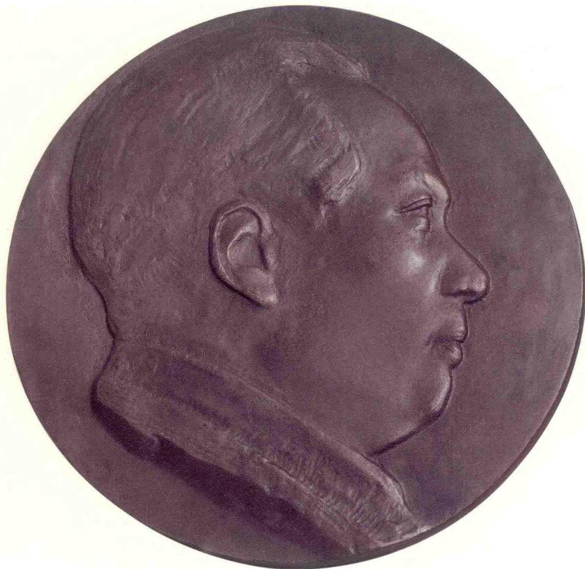
新中国缔造者——毛泽东 青铜浮雕 1949—1950 年 中国国家博物馆