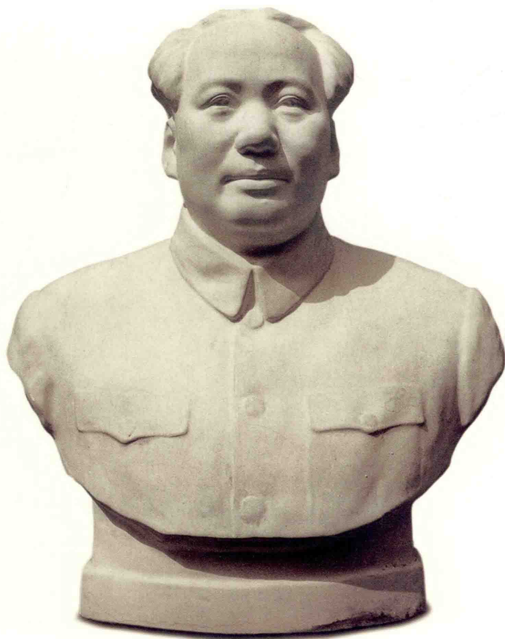
人民领袖 石膏圆雕 1950 年