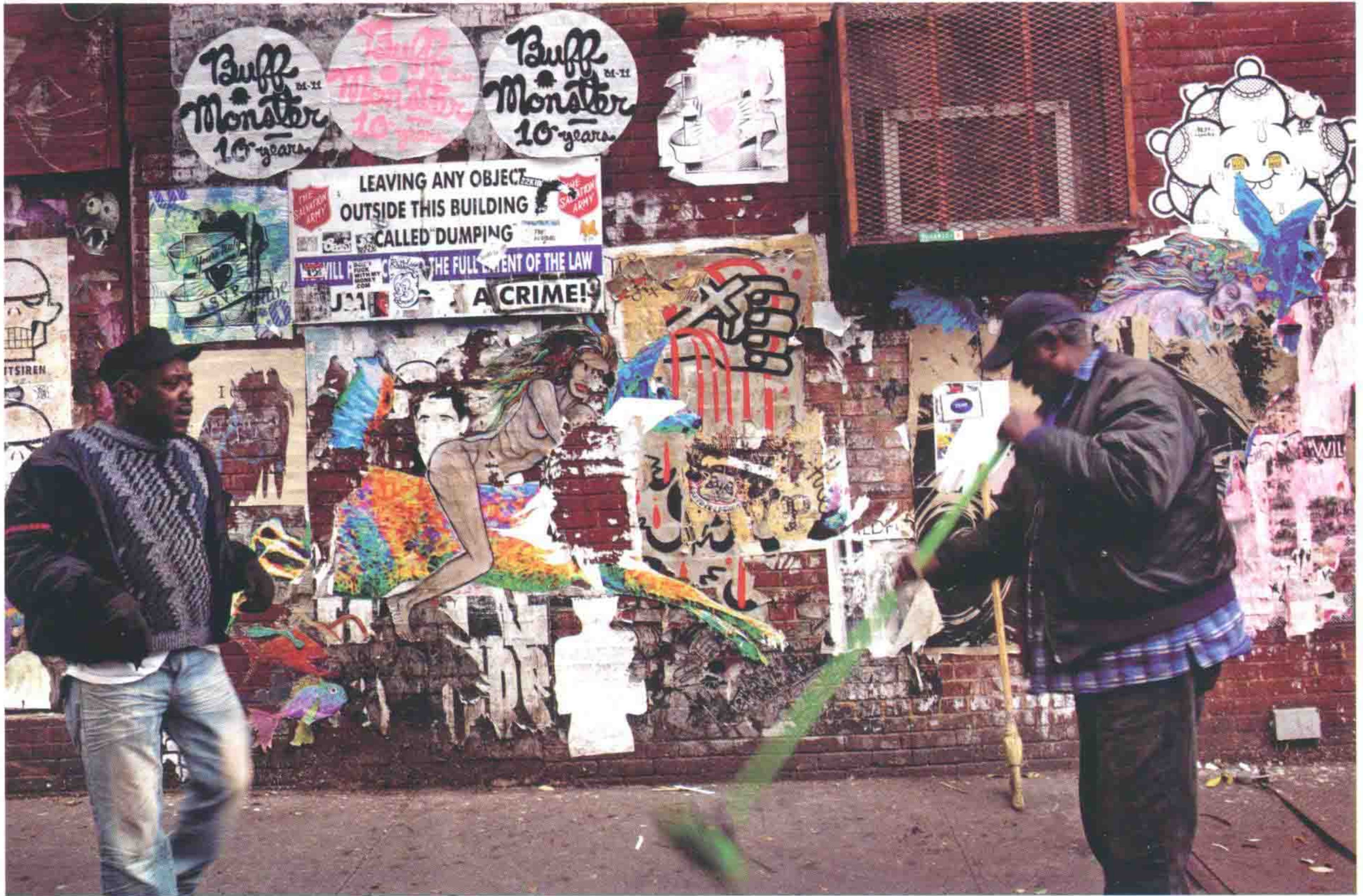
2012 年 10 月 28 日，美国纽约 October 28, 2012, New York, USA