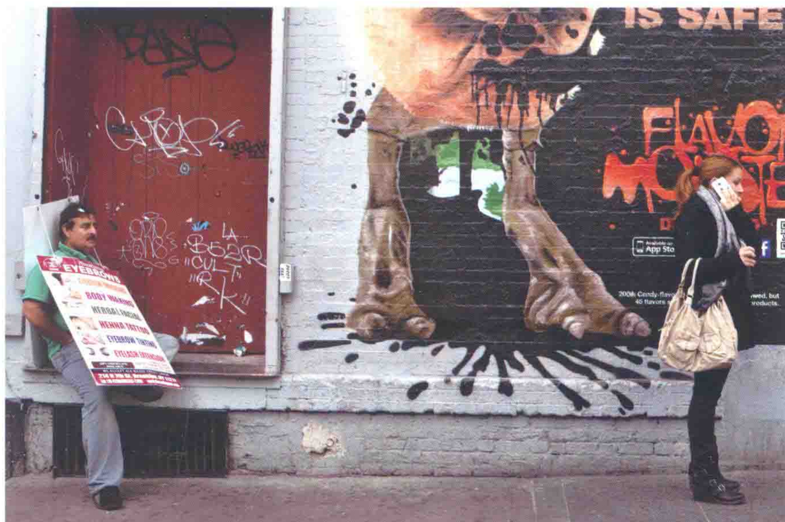
2012 年 10 月 28 日，美国纽约 October 28, 2012, New York, USA