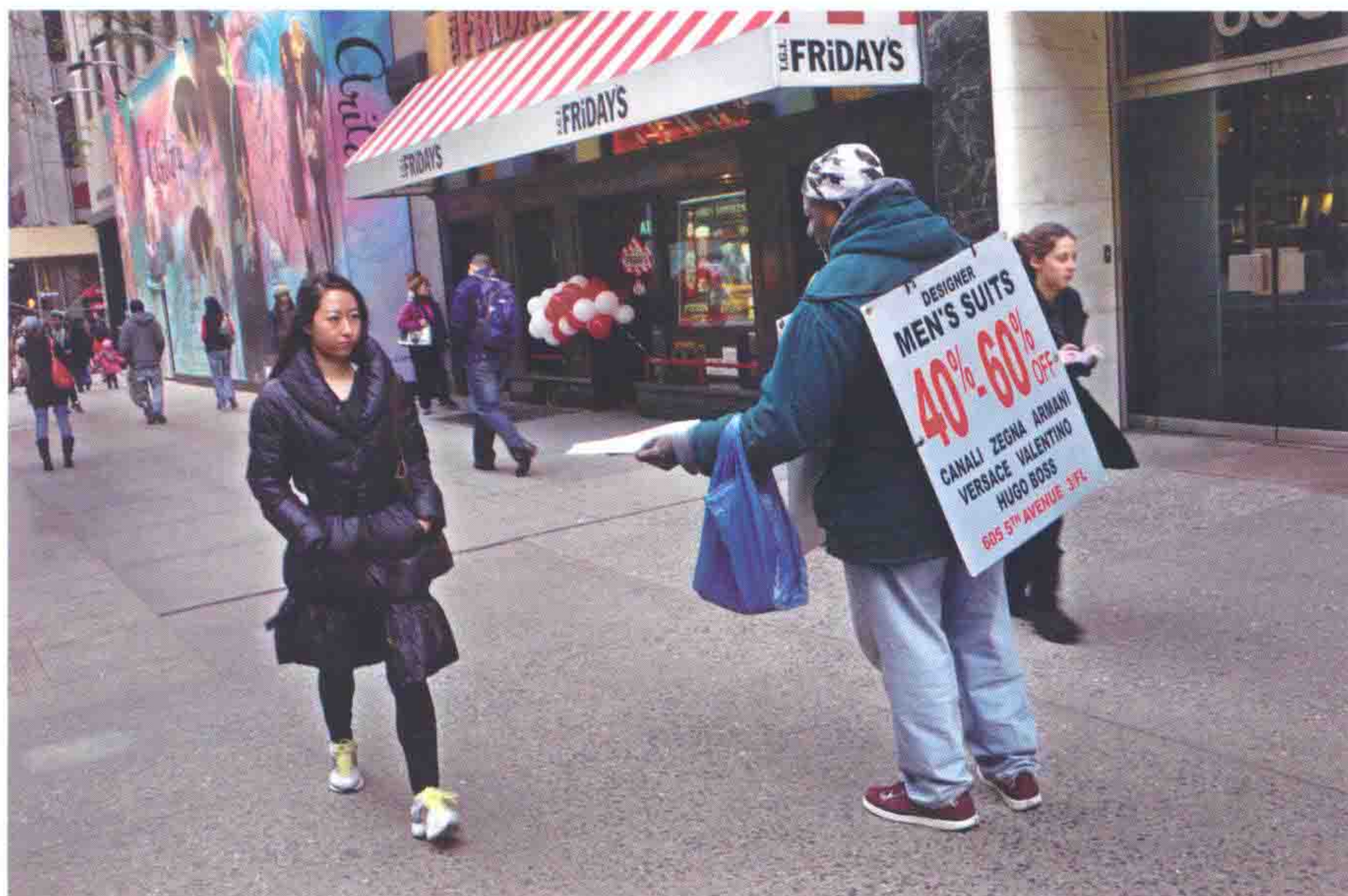
2012 年 10 月 28 日，美国纽约 October 28, 2012, New York, USA