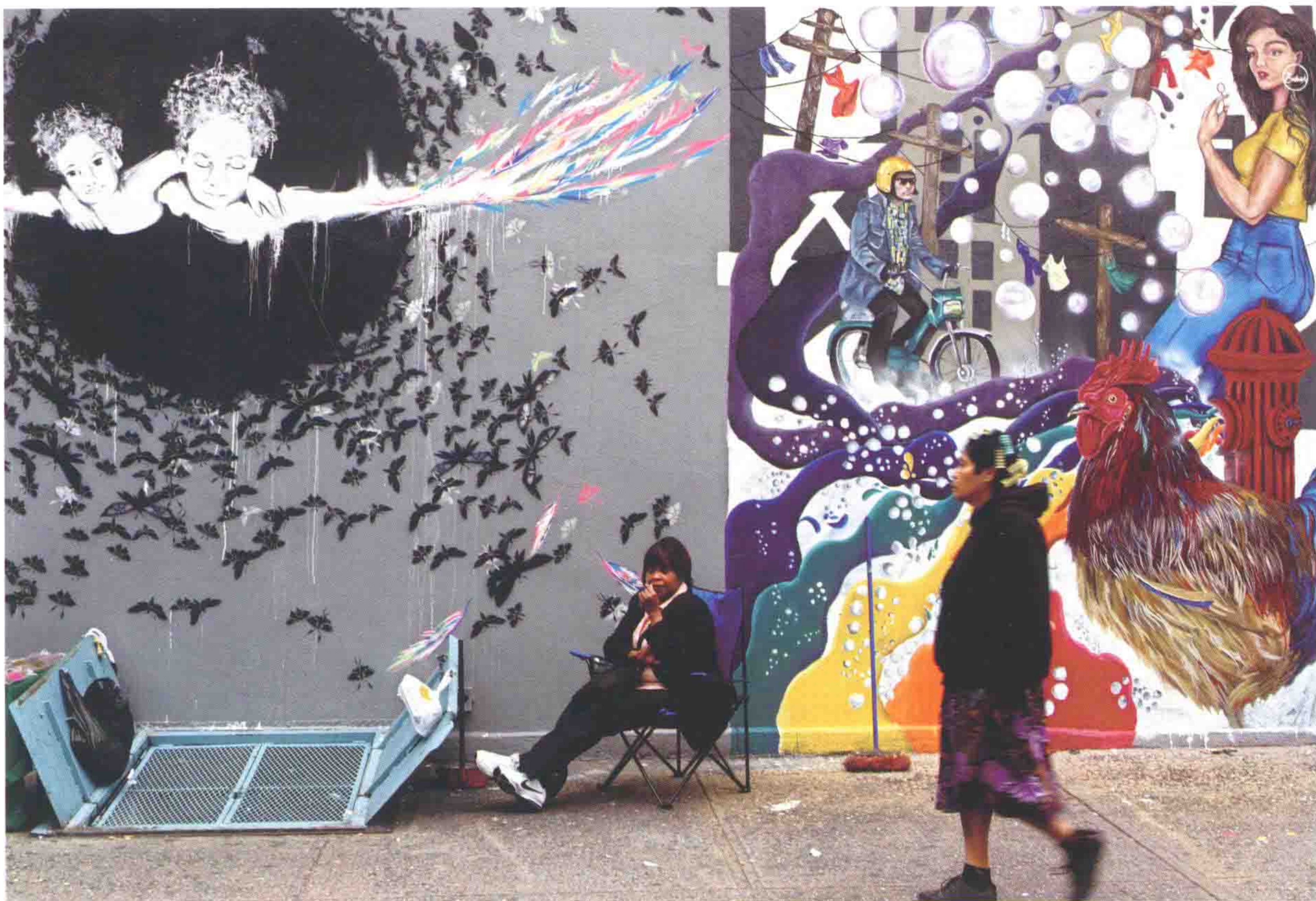
2012 年 10 月 27 日，美国纽约 October 27, 2012, New York, USA