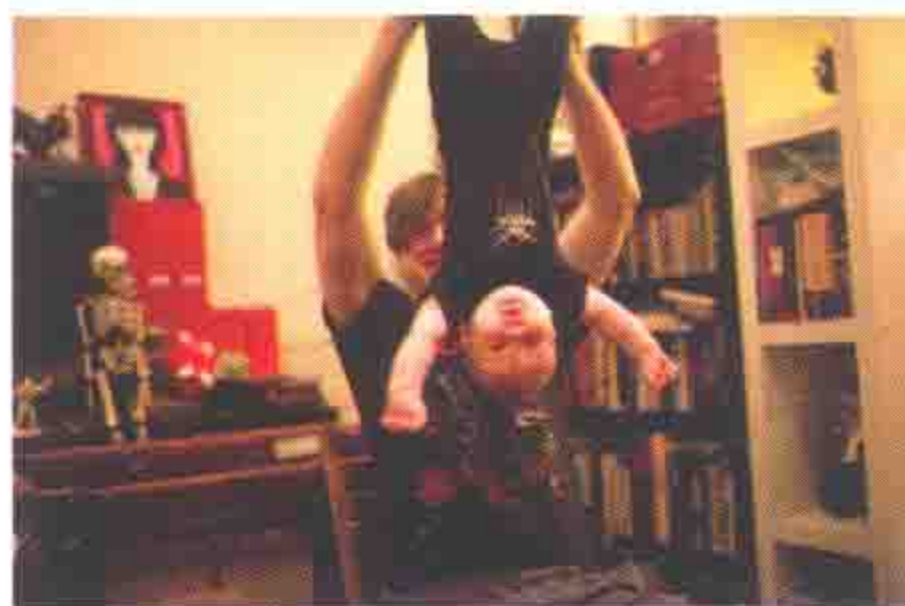
美国影像 U.S. IMAGE