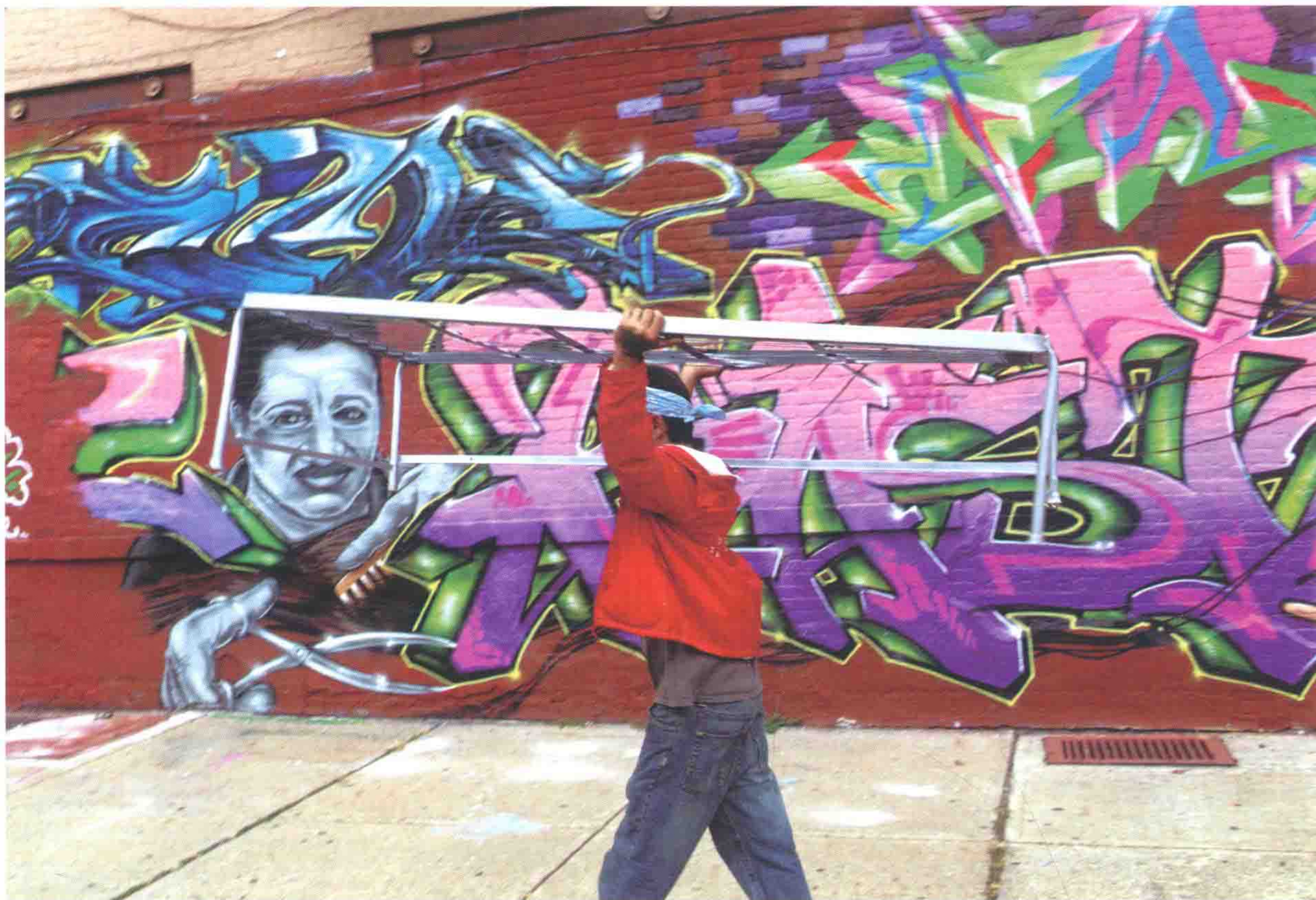
2012 年 10 月 27 日美国纽约 October 27, 2012 in New York