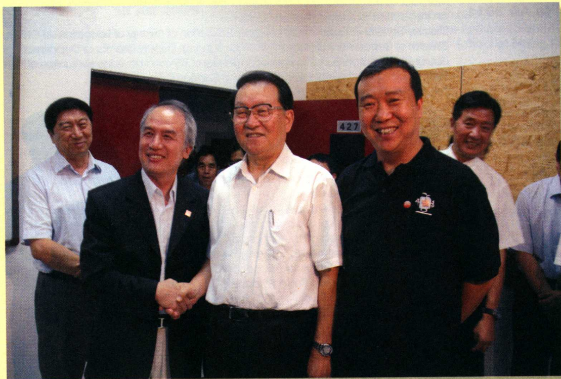
2012年时任中央政治局常委李长春（中）到院视察 Member of the Standing Committee of the Political Bureau Li Changchun (middle) inspected Animation School in 2012