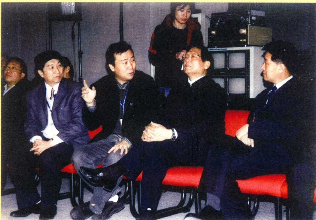
2005年，时任北京市委书记刘淇视察动画学院 Secretary of the CPC Beijing Municipal Committee Liu Qi inspected Animation School in 2005