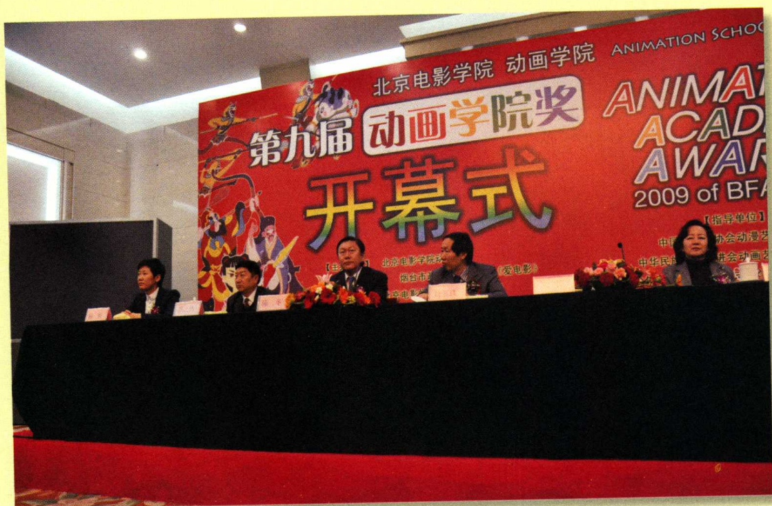
2009年12月3日，北京电影学院动画学院第九届动画学院奖开幕式在北京人民大会堂河南厅举行 The 9 th Animation Academy Awards of the Animation School of Beijing Film Academy was held in Henan hall of the Great Hall of the People, Beijing on December 3, 2009