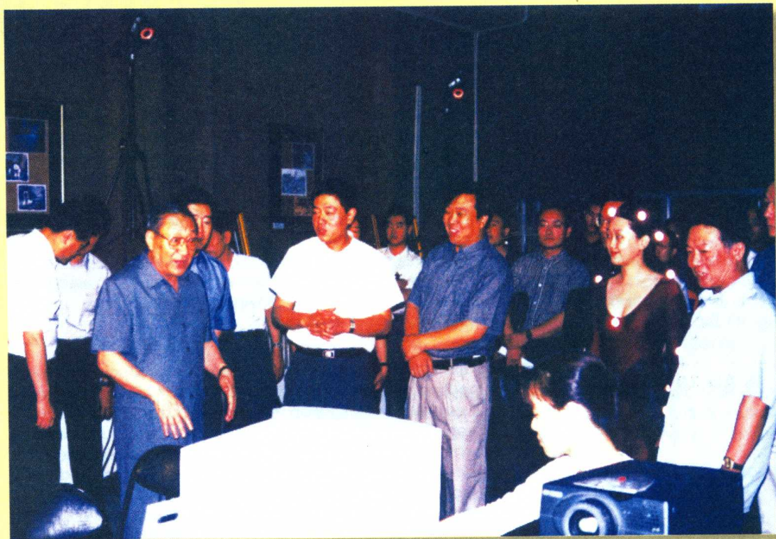
2000年时任国务院副总理李岚清（左一）到院视察 Vice-Premier of the State Council Li Lanqing (first from the left) inspected Animation School in 2000