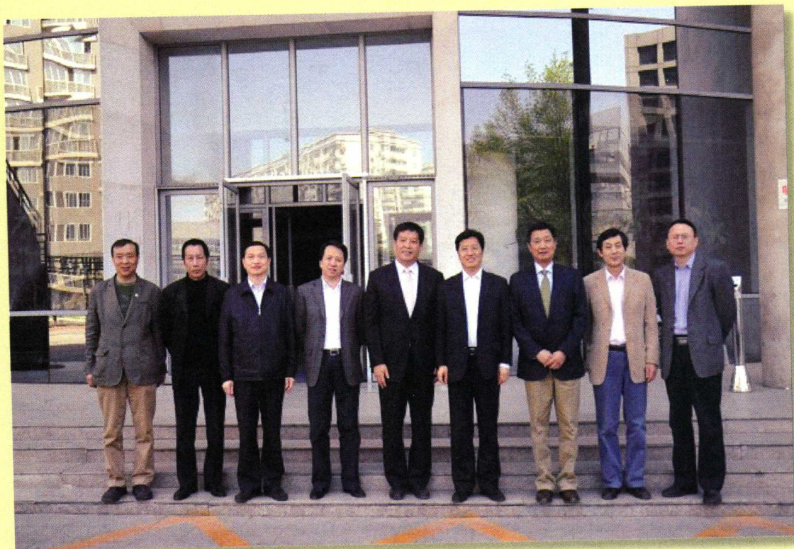
2012年时任教育部党组副书记、副部长杜玉波等到院调研 Deputy secretary of the general Party ranch, Vice Minister of the Ministry of Education Du Yubo and other leaders investigated Animation School in 2012