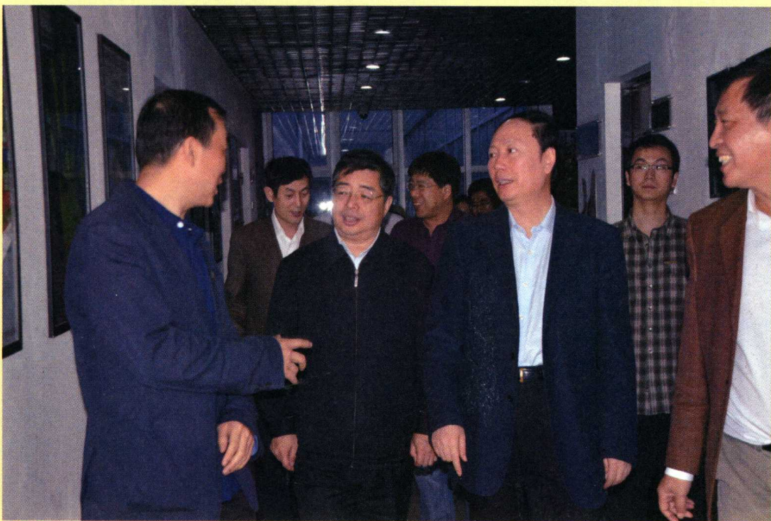
2012年，时任文化部副部长杨志今、中央党校副校长李书磊一行来动画学院调研 Vice Minister of the Ministry of Culture Yang Zhijin, Vice-President of the Party School of the Central Committee Li Shulei and other leaders came to the Animation School and made an investigation in 2012