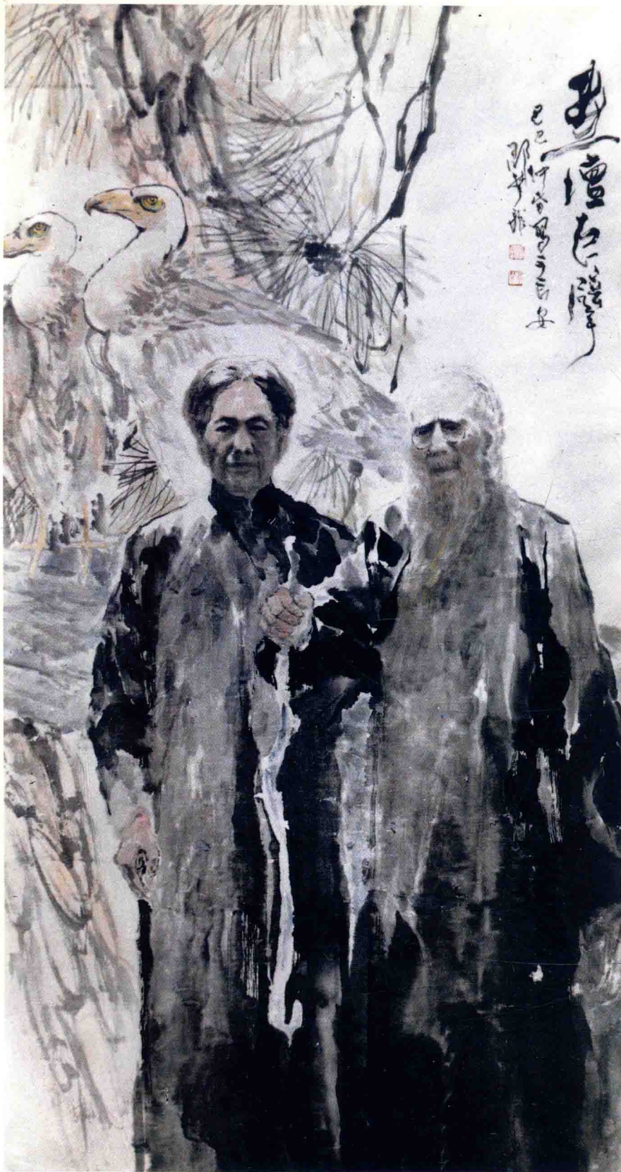
画坛巨擘 Two great artists