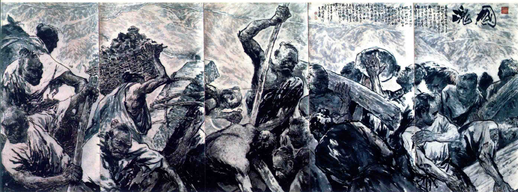
《国魂》长卷(1000cm×200cm) National Soul(The Great Wall)