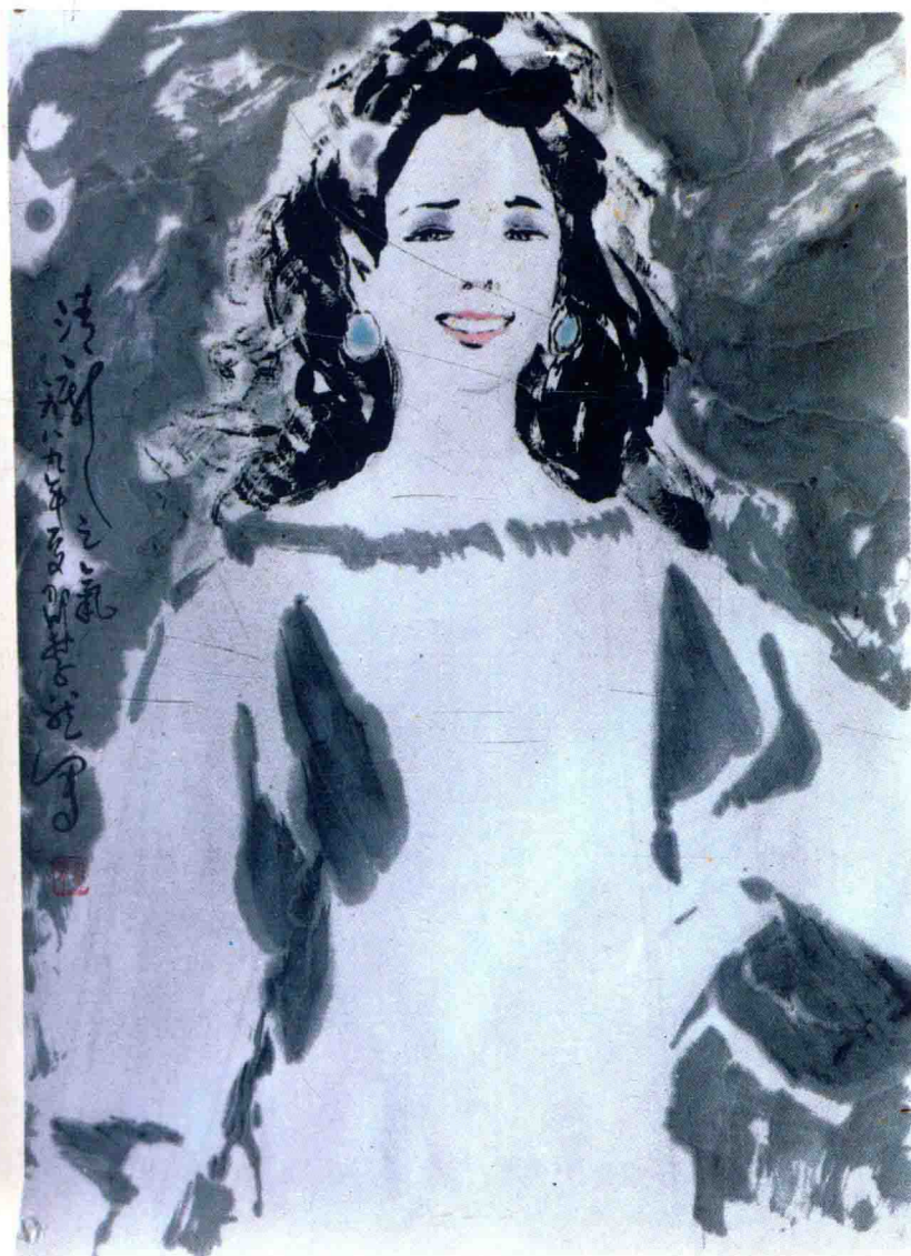
清新之气 Pure and fresh