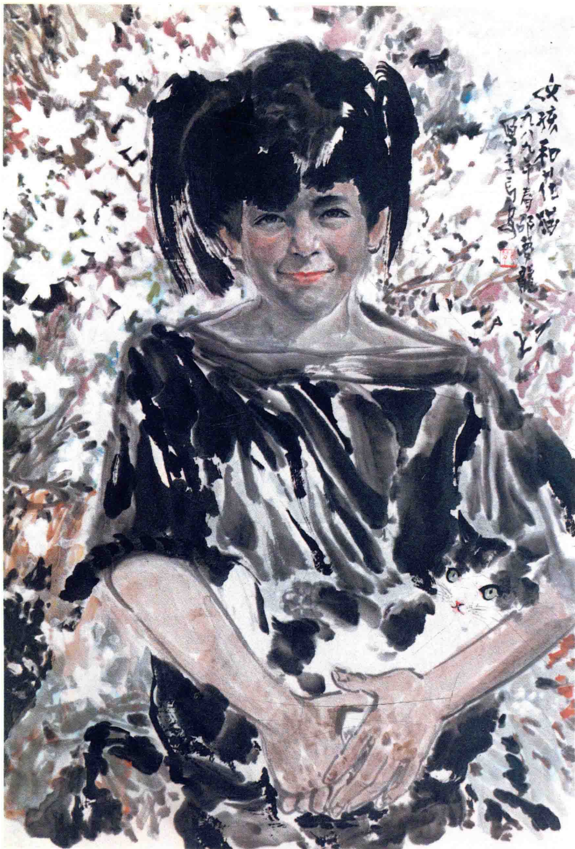
女孩和花猫 Girl and black-and-white cat