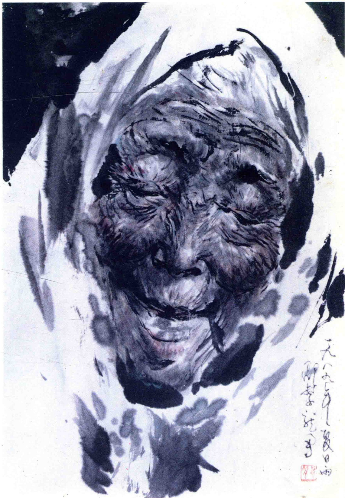
老嫗 Old woman