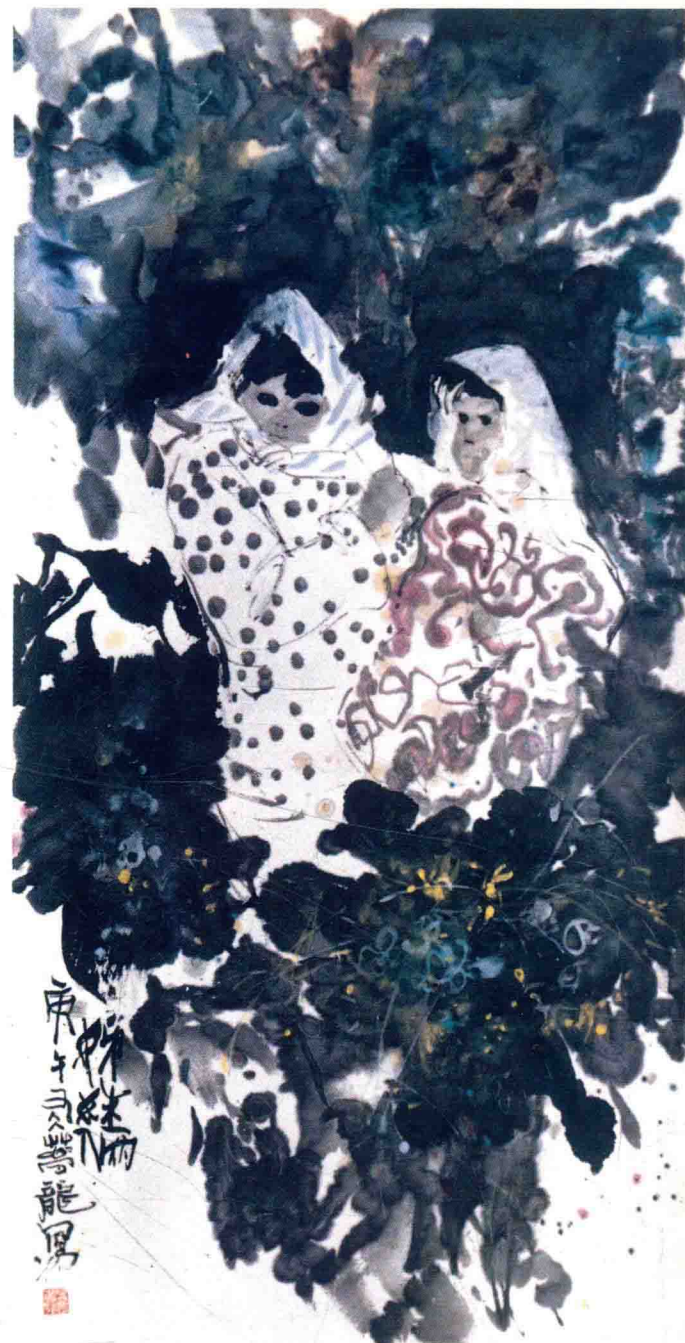
姊妹俩 Two sisters