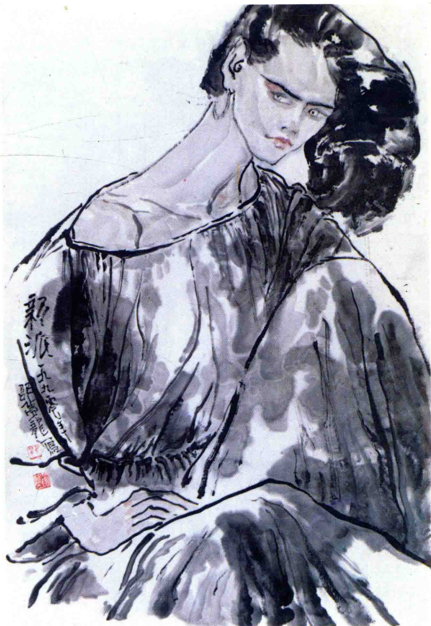
新派 In the latest fashion