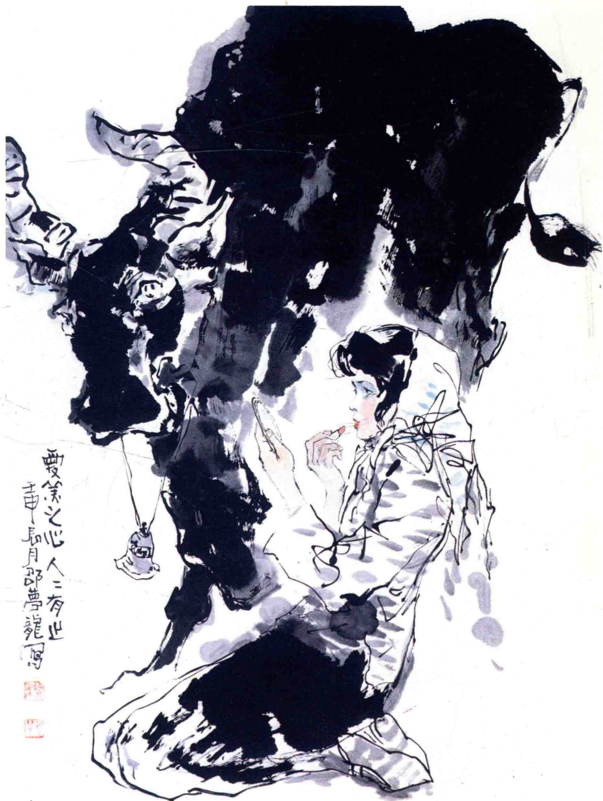
爱美之心 人人有之 Love for beauty——nature of human beings