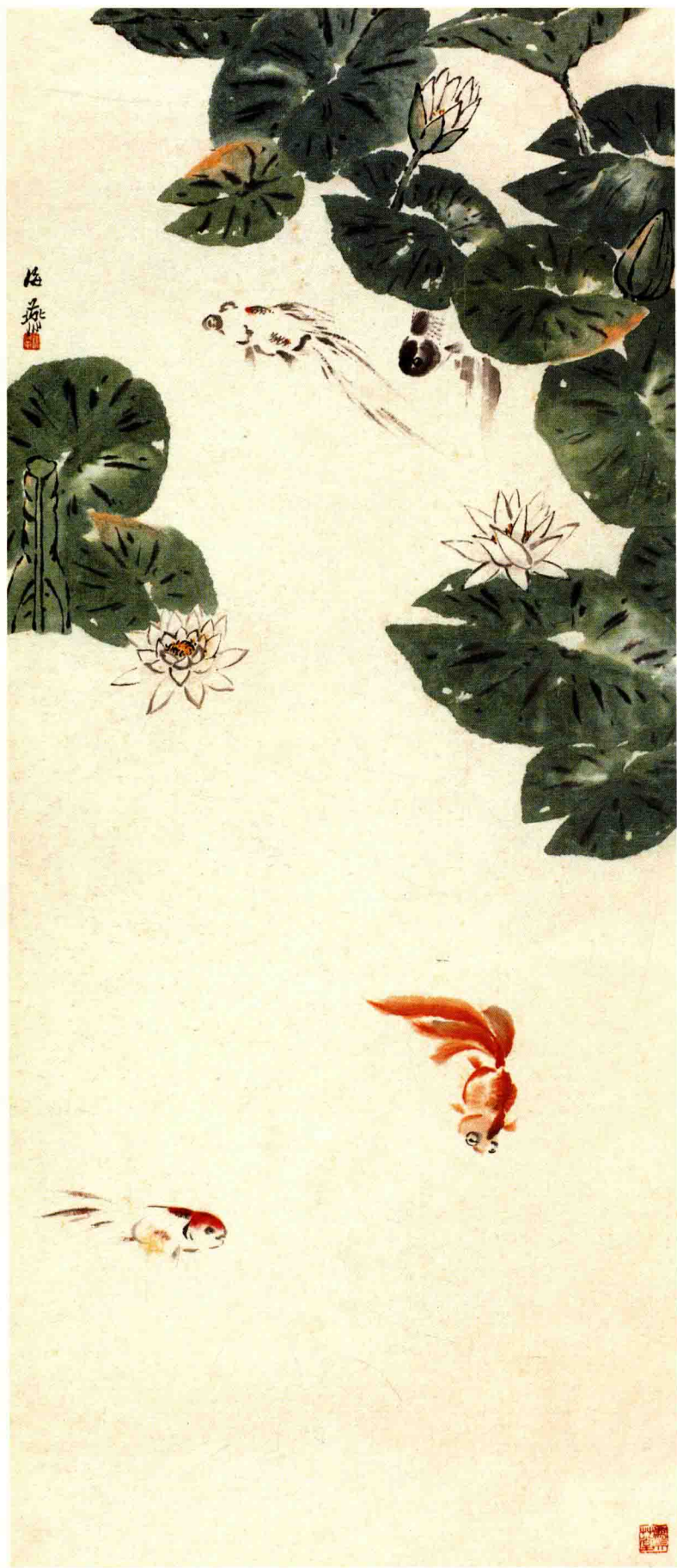
谢海燕《金玉满堂》147.5 × 63.5cm 1959 年 Xie Hai-yan Golden Fish