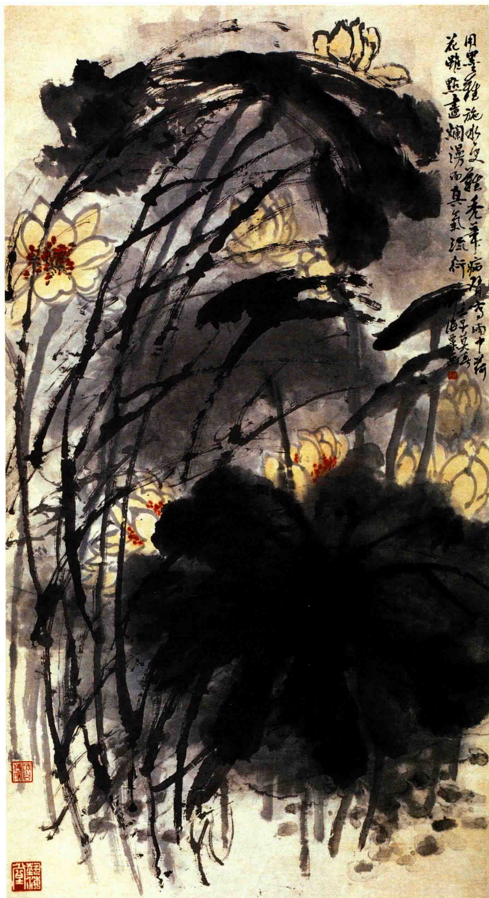
刘海粟《荷花》148 × 80.5cm 1972 年 Liu Hai-shu Lotus