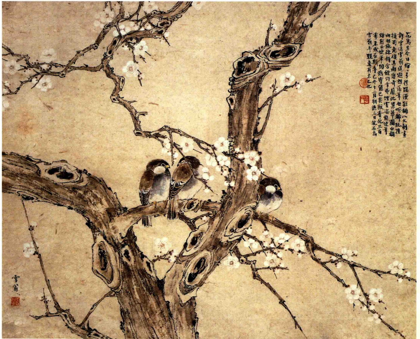
Chen Zi-fu Birds and Flowers 陈之佛《梅梢三雀》49 × 60cm 1941 年